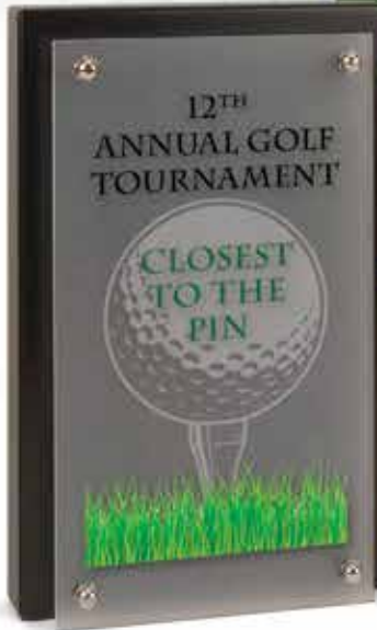
STF-D (5 x 8)