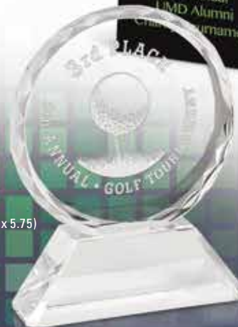
CC (4.375 x 5.75)