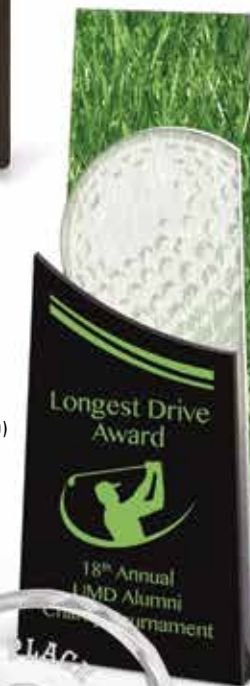
STRA (3.375 x 9)