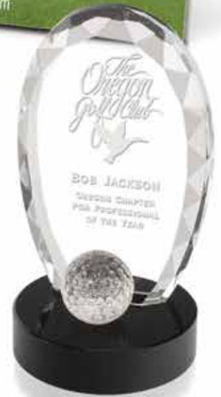
CGBB (4 x 7.5)