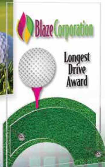
SPEC-C (5 x 8)