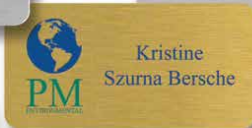
03K-1 or 03K-2 (3 x 1.5) Brass