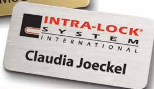
03K-1 or 03K-2 (3 x 1.5) Nickel-Silver