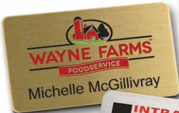
03K-5 or 03K-6 (3.5 x 2) Brass