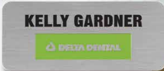
03K-3 or 03K-4 (3.5 x 1.5) Nickel-Silver