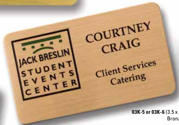
03K-5 or 03K-6 (3.5 x 2) Bronze