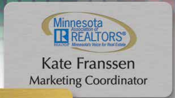
03K-5 or 03K-6 (3.5 x 2) Nickel-Silver