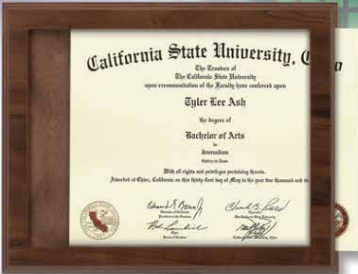
CHE (13 x 10.5) Holds an 11 x 8.5 certificate