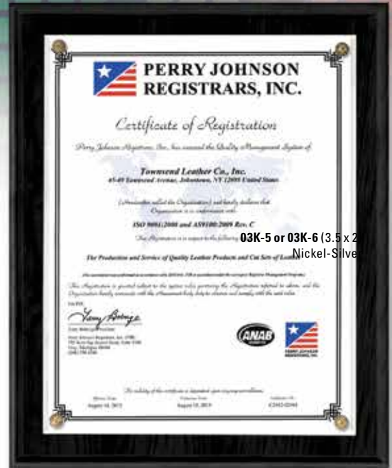
03K-5 or 03K-6 (3.5 x 2) Nickel-Silver